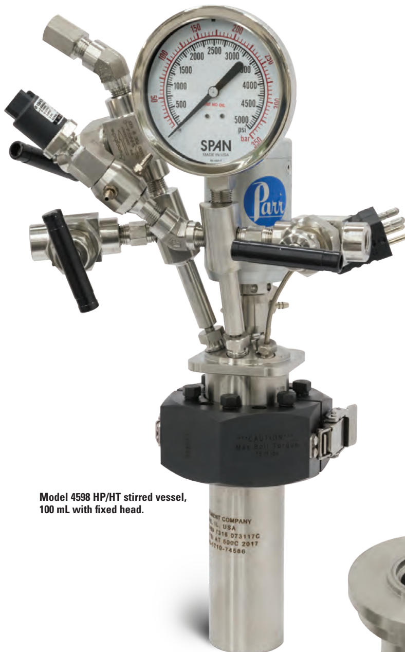
Model 4598 HP/HT stirred vessel, 100 mL with fixed head.