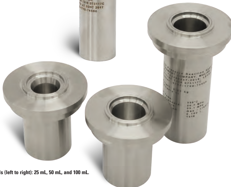
4590 vessels (left to right): 25 mL, 50 mL, and 100 mL.