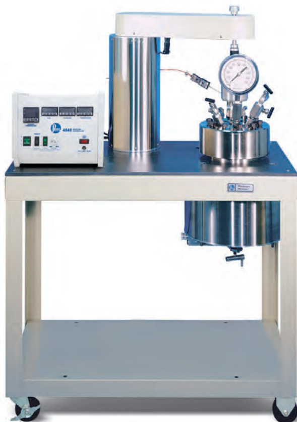
4551 Moveable Head Reactor on Moveable Cart, 1 Gallon, with Bottom Drain Valve, and a 4848 Temperature Controller shown with optional Expansion Modules.

The innovative Parr Hinged Split-Rings on the 4553 and 4554 add to a safe vessel removal routine. Simply loosen the compression bolts, unlatch the split-ring closures, and pivot the split-rings out of the way.