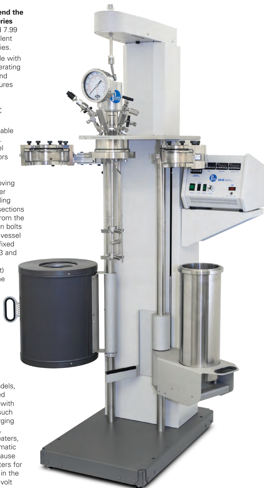
Model 4554 Floor Stand Reactor, Two Gallon, Fixed Head, Pneumatic Lift, Hinged Split-Rings, opened to show Internal Fittings and Serpentine Cooling Coil, with 4848 Reactor Controller shown with optional Expansion Modules.

The 1 gallon size is usually recommended for high viscosity polymer studies. An optional bottom drain valve may be added for convenient product recovery. As with the smaller floor stand models, these larger, self-contained systems can be equipped with a variety of attachments, such as condensers, solids charging ports, bottom drain valves, special motors, custom heaters, jacketed vessels and automatic valves and regulators. Because of the higher wattage heaters for these reactors, all models in the 4550 Series require a 230 volt power supply.