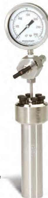
Model 4750-200mL-A Vessel, with 4310 Gage Block Assembly.