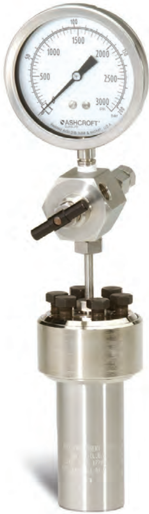
Model 4750-125mL-A Vessel, with 4310 Gage Block Assembly.