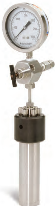
Model 4740-75mL-A Vessel, with 4310 Gage Block Assembly.

A composite identification number to be used when ordering a 4740 Series Pressure Vessel System can be developed by combining individual symbols from the separate sections below. For more information on how to use this ordering guide, please see page 27 .