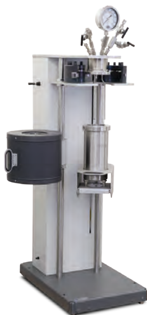
4680-1800mL Fixed Head Vessel shown with Split Rings open and vessel down using a pneumatic lift.