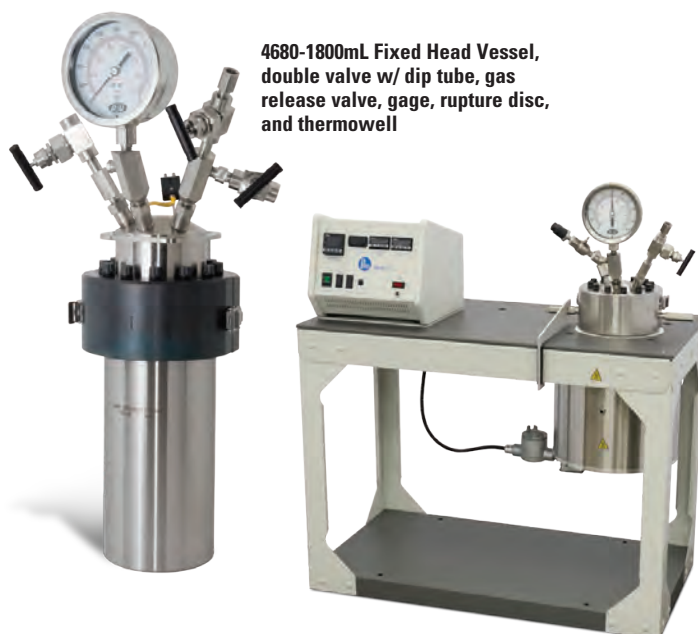
4680-1800mL Fixed Head Vessel, double valve w/ dip tube, gas release valve, gage, rupture disc, and thermowell