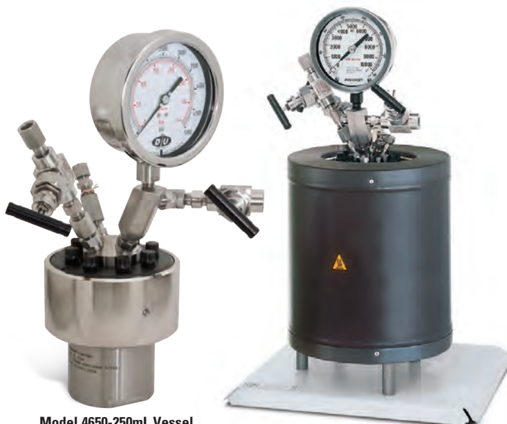
Model 4650-250mL Vessel with VGR, Thermocouple, and Single Inlet Valve (-VD)