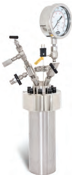
Model 4625-1200mL-VGR-DVD Vessel

Standard Maximum Operating Temperature, °C: 350 w/ PTFE Flat Gasket