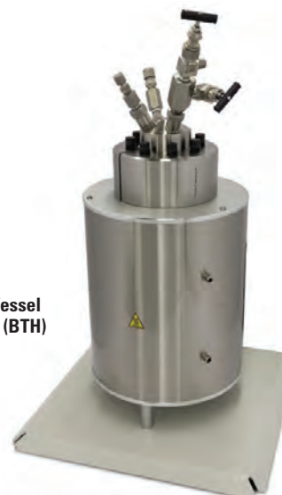
Model 4625-1200mL Vessel w/ Bench Top Heater (BTH)