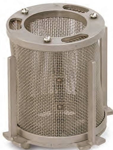
Catalyst Basket Static Design with Uniflow Stirrer