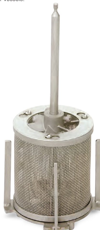
Catalyst Basket Dynamic Design